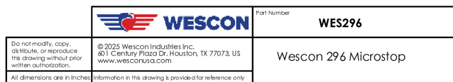
Additional product image