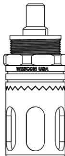
WES296-SL-S Microstop with Ø 1/4" Standard Shaft