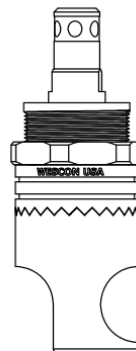
WES296-SCA-QC Microstop with Quick Change Shaft