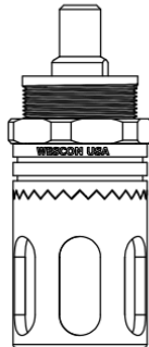
WES296-SL-S Microstop with Ø 1/4" Standard Shaft