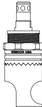
WES296-SCA-QC Microstop with Quick Change Shaft