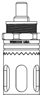
WES296-SL-S Microstop with Ø 1/4" Standard Shaft