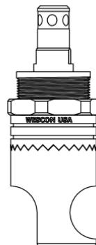
WES296-SCA-QC Microstop with Quick Change Shaft