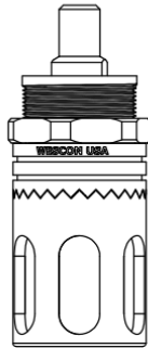
WES296-SL-S Microstop with Ø 1/4" Standard Shaft