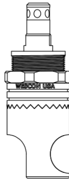
WES297-SCA-QC Microstop with Quick Change Shaft