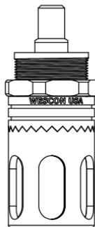
WES297-SL-S Microstop with Ø 1/4" Standard Shaft