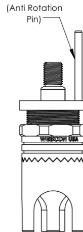
WES297-S3L-TS-AR Microstop with 1/4-28 Threaded Shank Shaft and Anti Rotation Pin

*For Skirt options see next page and website.