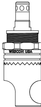
WES297-SCA-QC Microstop with Quick Change Shaft