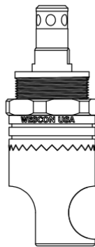
WES297-SCA-QC Microstop with Quick Change Shaft