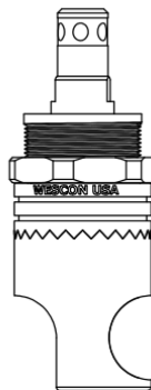
WES297-SCA-QC Microstop with Quick Change Shaft