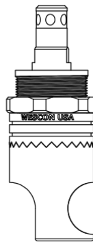
WES297-SCA-QC Microstop with Quick Change Shaft