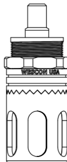
WES297-SL-S Microstop with 1/4" Standard Shaft