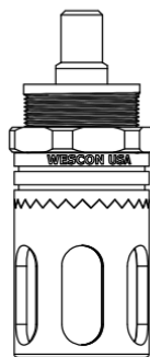
WES297-SL-S Microstop with 1/4" Standard Shaft