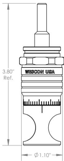
WES596-S Microstop with Ø 1/4" Standard Shaft