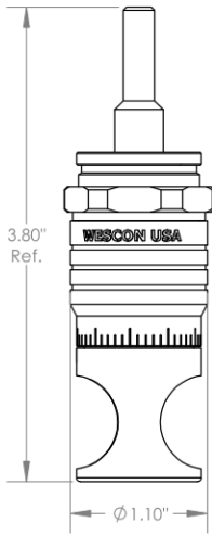
WES597-S Microstop with Ø 1/4" Standard Shaft