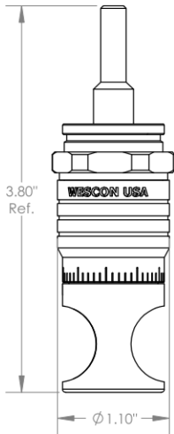
WES597-S Microstop with 1/4" Standard Shaft