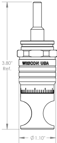
WES597-S Microstop with Ø 1/4" Standard Shaft