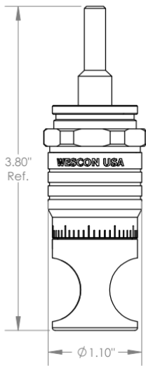
WES597-S Microstop with Ø 1/4" Standard Shaft